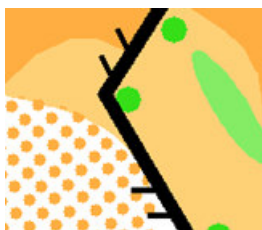
Forbidden to pass

Fences: Two types of fences exist in the area. It is NOT ALLOWED to pass fences marked with double hatches and thick lines (see below). Fences drawn with single hatches and thin line may be passed (but not damaged).