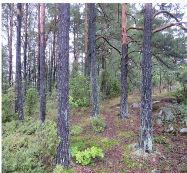
Terrain photo ROC 2