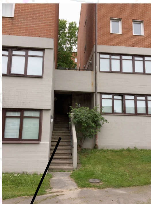
...and from below