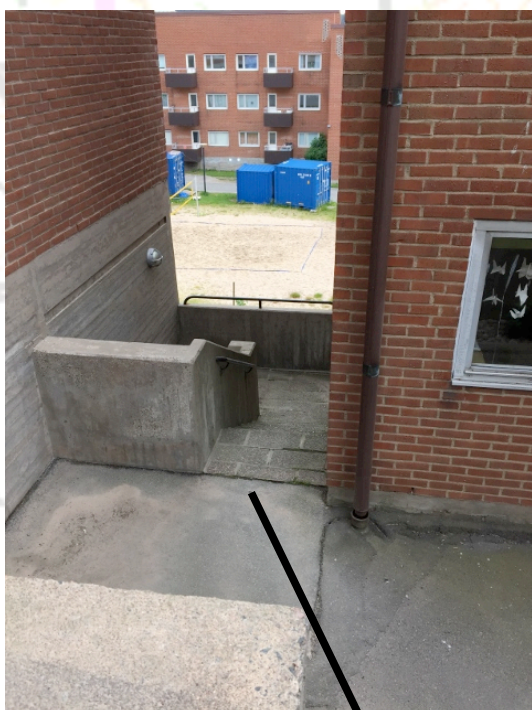
Stair case from above...

Hilliness: Moderate with elements of vigorous hilliness.