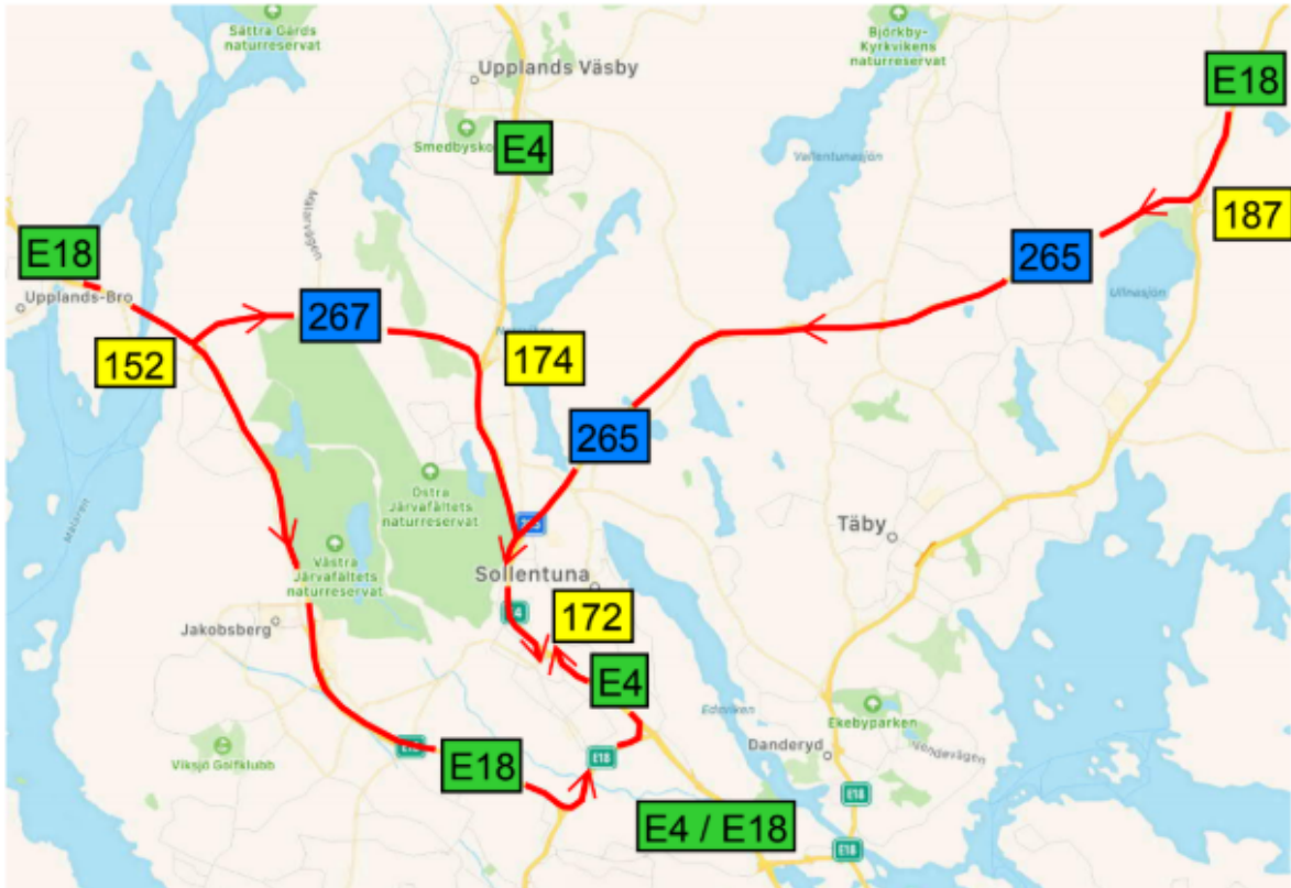
How to drive to intersection Tureberg, exit no 172 on E4