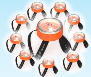
Str8 WOD compasses