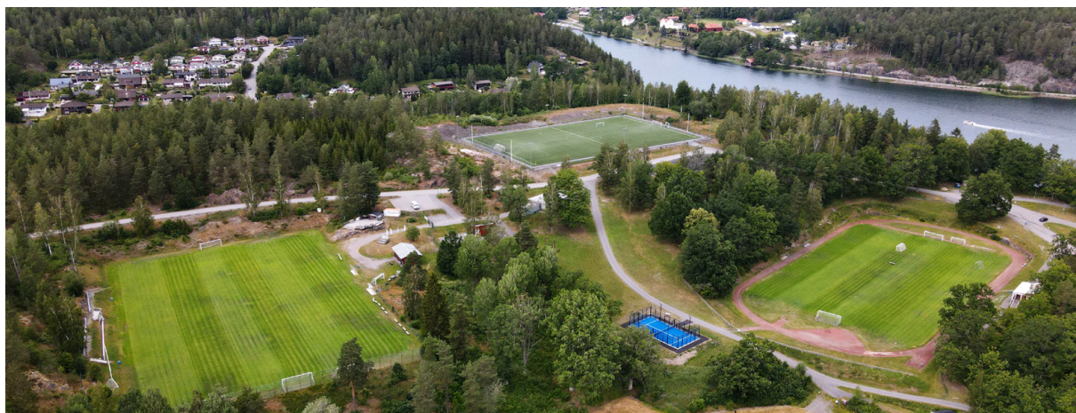
The Arena Center of Grännäs is named the finest sports field in Sweden. To the right is the competition center and the other two soccer fields will be for tents.